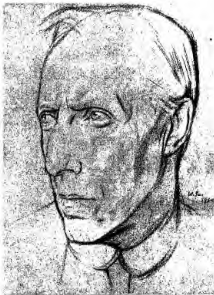
CECIL J. SHARP

From a portrait by SIR WILLIAM ROSENSTEIN Reproduced by permission of the artist and The English Folk Dance and Song Society